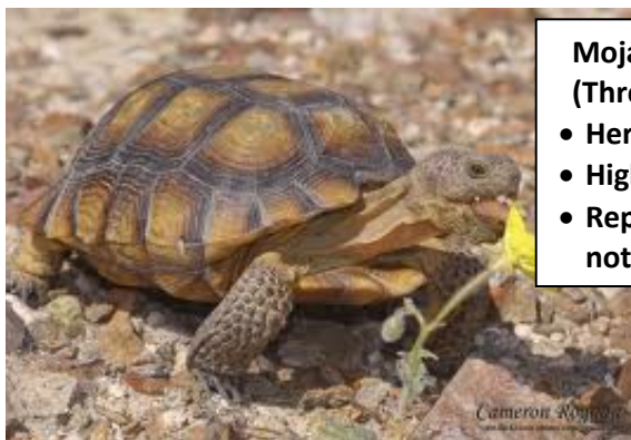
Mojave Desert tortoise (Threatened; 9-15")