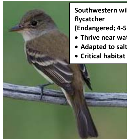
Southwestern willow flycatcher (Endangered; 4-5")