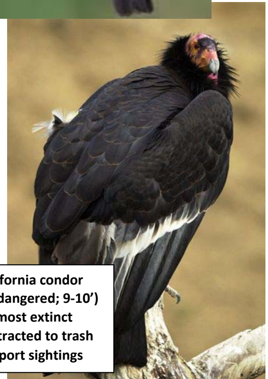
California condor (Endangered; 9-10')