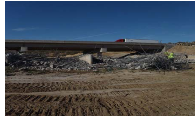
US 93 Wagon Bow & Deluge Wash