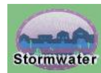
Pima Association of Governments Stormwater Management Working Group