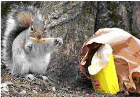
"What are YOU looking at?"

Best rule of thumb – if you are at all uncertain – DON'T TOUCH IT AND INFORM YOUR LOCAL DPS