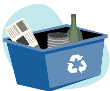
Adopt a Highway participants are encouraged to recycle.