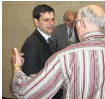
Phoenix Mayor Phil Gordon (left) holds a town hall meeting at Pecos Park Community Center March 6. Transportation was a big topic: "I don't support it built on Pecos Road," said the mayor about the South Mountain Loop 202.

If the questions asked by residents at Tuesday night's town hall meeting with Mayor Phil Gordon are any indication, transportation seems to be on the minds of most Ahwatukee Foothills residents.